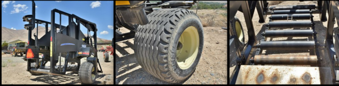
2017 Phiber VS1206 —Bale accumulator capable of stacking two to three high, unloads in varying speeds between 3 and 13 mph, fully automatic..... $24,000