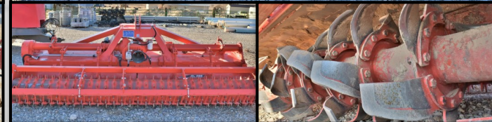
2019 Kuhn EL282-400 Power Tiller—13 ft., Good Condition.....$27,950