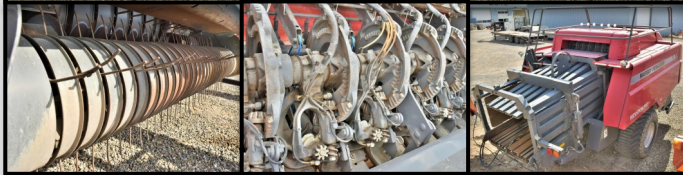
2013 Massey Ferguson 2170—3x4 baler.....$64,000