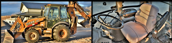
2016 Case 580SN WT—3,100 hours.....$69,500