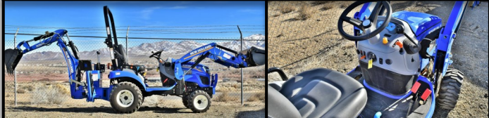
2019 New Holland Workmaster 25S —Front-end loader & backhoe. 7.6 Hours. Comes with Manufacturer's Warranty..... $17,900 www.carterag.com