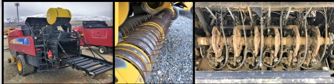
2012 New Holland BB9080 —3x4 baler, 32,800 bales..... $39,000