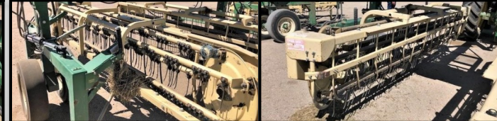
2014 Allen Rake 8803—Clean Unit.....$12,500