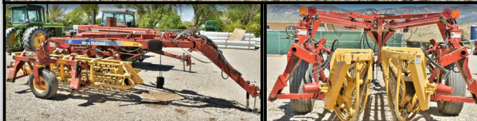
2008 New Holland 216 Rake.....$11,500