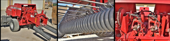
2011 Massey Ferguson 1841 —2-tie baler, lightly used, excellent condition, selling under consignment, no bale count..... $22,900