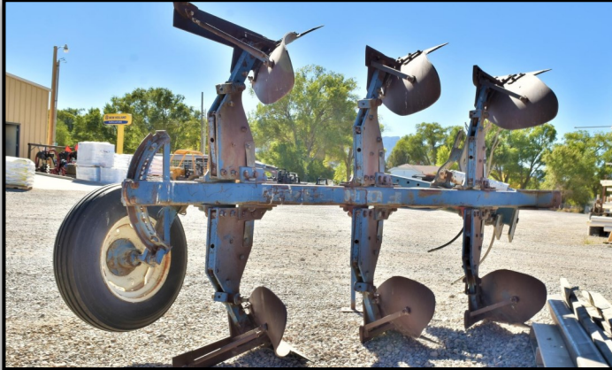
Ford 145 — Plow, new ware parts.....$2,450