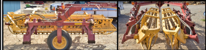
2008 New Holland 216 Rake ..... $10,900