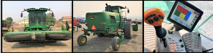
2015 John Deere W260 —16 ft. Rotary Header, Low Hours, Good Condition..... $118,000