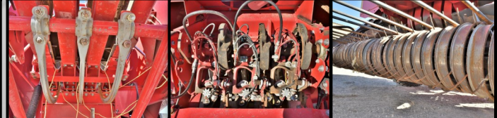
2017 Massey Ferguson 1844S —3,233 hours.... $35,000