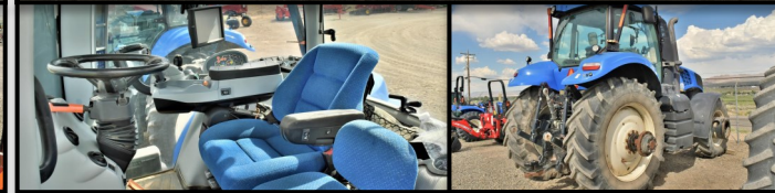
2013 New Holland T8.360—4WD, Powershift, 1,360 hours, suspended front axle, GPS.....$149,000