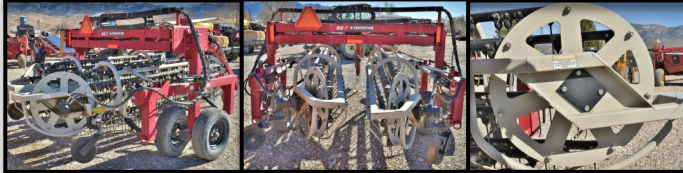
Twinstar G2-7—Twinrake, Selling under consign- ment.....$19,900