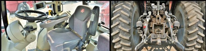
2014 Massey Ferguson 7620— 1,340 hours, CVT transmission, Duals, 180 engine horsepower, GP, On Rent.....$105,000