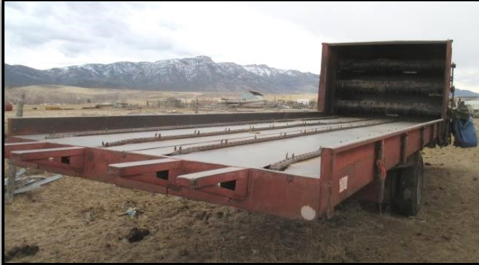
Kirby Mfg. Inc 6-Straw Bedder—6 x 8 x 28....$22,750