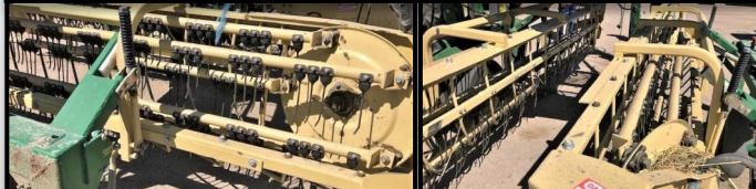
2015 Allen Rake 8803—This is a great rake in field ready condition.....$14,500