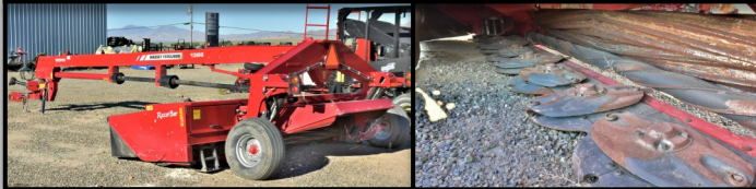
2014 Massey Ferguson 1386 —16-ft., Very Good Condition..... $29,900