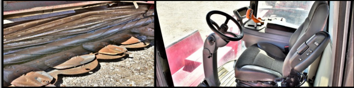
2016 Massey Ferguson WR9870 —1,350 hours, single conditioner, GPS..... $92,000