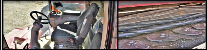
2019 Massey Ferguson WR9980 —1,000 hours, single conditioner, GPS..... $119,000