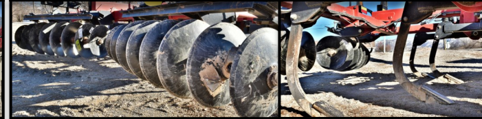
Case MRX690—Good condition, 10 ft. wide....$19,000