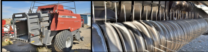
2008 Massey Ferguson 2190 — 4'x4' bale size, single axle..... $41,000