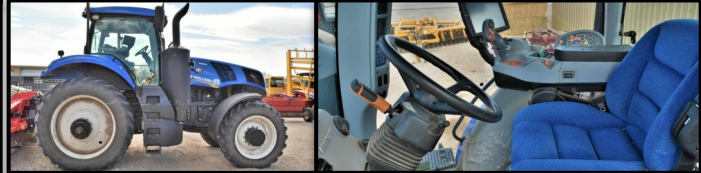
2015 New Holland T8.320 —1,064 hours, CVT Transmission, GPS, On Rent..... $175,000